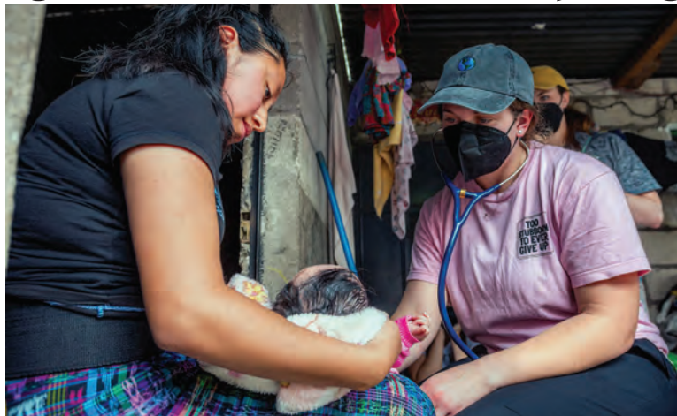
The San Lucas mission provides healthcare through a hospital and a Health Promoter Program.