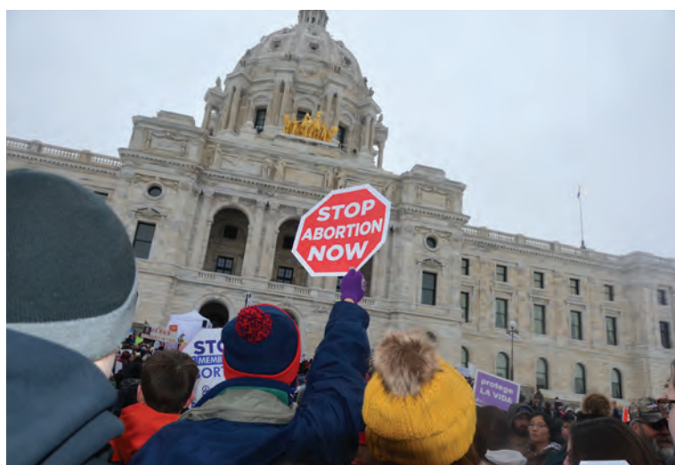
March for Life 2020 at the Minnesota State Capitol in St. Paul.

The vigil has always coincided with the eve of the March for Life, which marks the date of the 1973 decision of the Supreme Court of the United States in Roe v. Wade that legalized and normalized the taking of innocent human life nationwide.