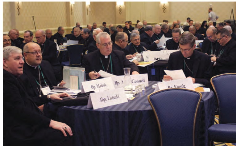
The U.S. bishops met in Baltimore for their annual fall general assembly on Nov. 14–17, 2022.